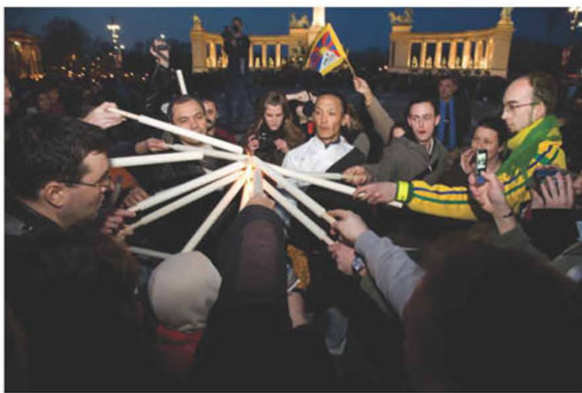
Peace Torch by Tibetan Refugees

the Dharma practitioners, students may also learn about the methods of practice and the acquisition of wisdom described in the books At the auditorium of the foundation there are regular screenings from the library's film archive, where are hundreds of films about Buddhism. The Sambhala Tibet Center's Bodhisattva Publisher, although modestly, but also deals with edition. During the swere published, with the Buddhado publishing, a few the Sambhala workshop project, and translated 15 books, Tibetan Buddhism. augmented our library message.