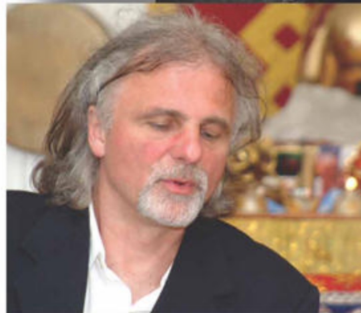
Leader and founder of TSA