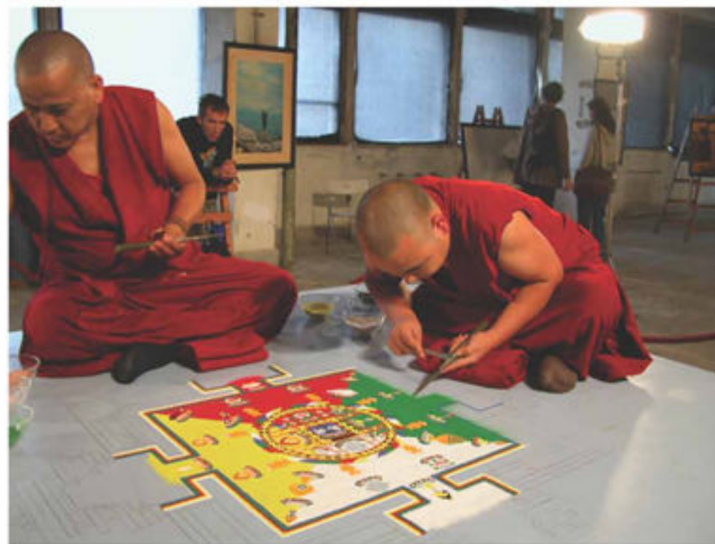
Monks making sand mandala

the following we list the ers and guests of the the demand of complete-The TSA also took of His Holiness the visits in Hungary. In as the inviter of His Buddhist communities entertains His Holiness