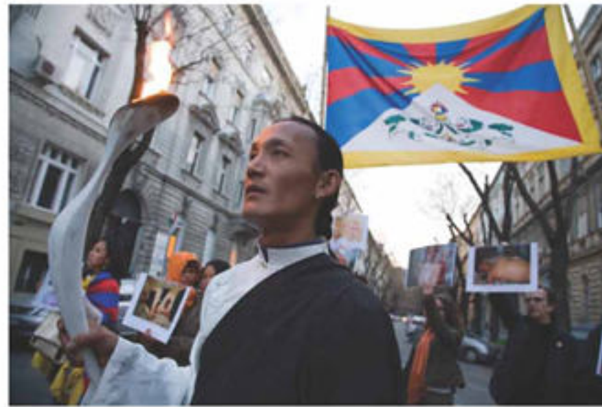
Tibetan refugees in Hungary

Our foundation is Parliament's Tibet-group, directly in the understand-His Holiness the Dalai visit to Hungary, will address of Budapest on the initiative of the